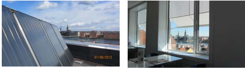
Fig. 4 Solar thermal installation on the roof (left) and automatic solar shading (right)