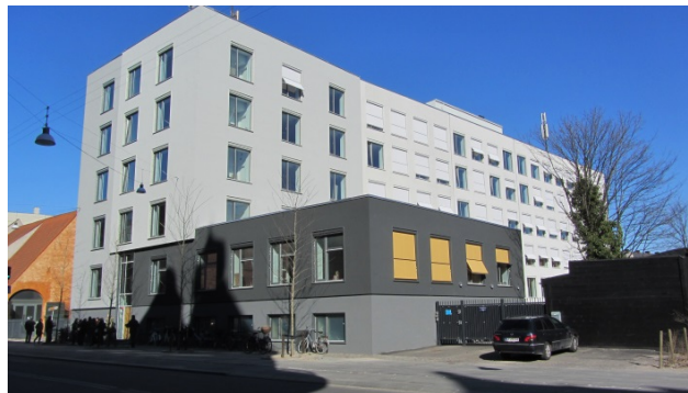
Fig. 3 The office building after retrofit