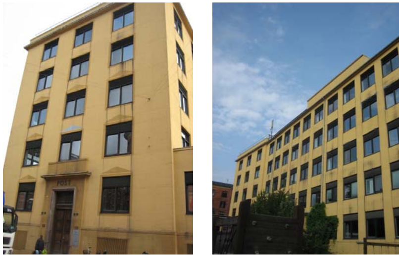
Fig. 1 The office building before retrofit

The building was constructed with a load-bearing slabs-/beams-system which resulted in a large degree of freedom in the design of the interior areas. After the post terminal moved to another building the interior was changed to function as an office building. Since the building was originally designed as an industrial building it has relatively thick concrete floor slabs and thus a relatively large thermal mass.